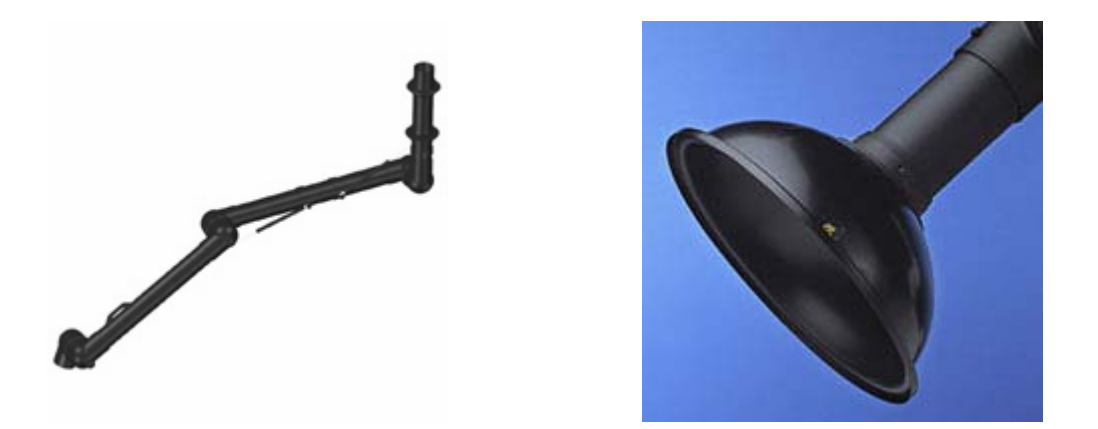
Figure 2: Test Piece 2

Figure 2 shows SYSTEM®100 with a hood that was fitted during the test.