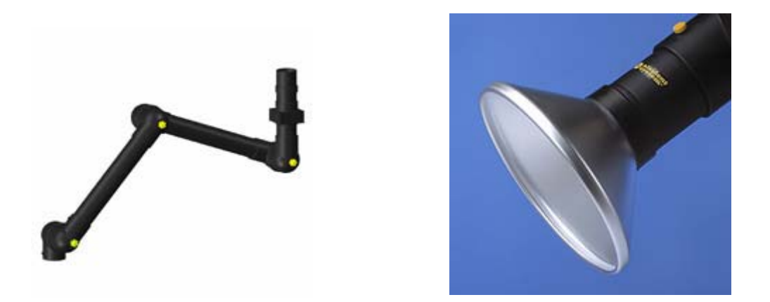
Figure 1: Test Piece 1

Figure 1 shows SYSTEM®75 with a hood that was fitted during the test.